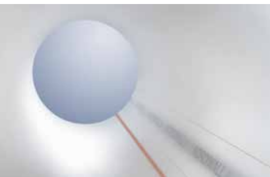
NORDIWALL - for gravity pipes