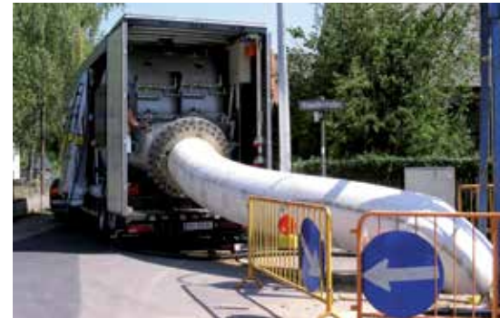
CIPP installation unit