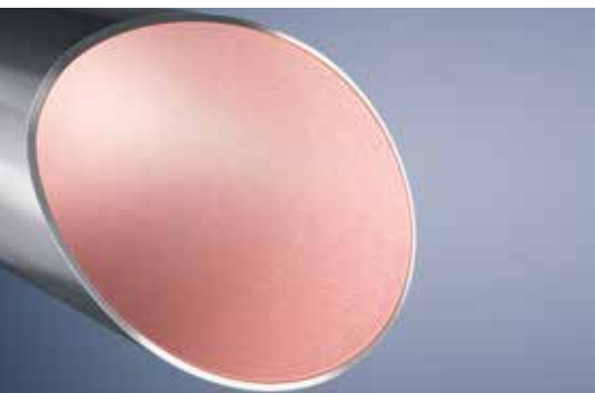
TUBETEX - for pressure pipes

NordiTube Technologies's portfolio comprises optimised solutions for maintenance, rehabilitation and renewal of gravity and pressure pipes, such as: