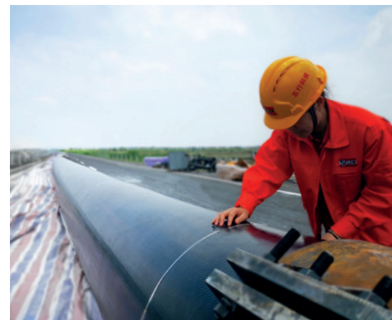
Individual lengths of up to 3 km on one pull