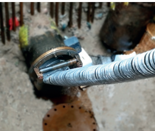
The NORDILINER is the optimal solution for trenchless pipe rehabilitation of pressure pipes